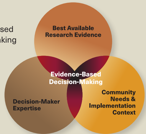
Figure 1. Evidence-Based Decision-Making Approach

EBDM recognizes that research evidence is not the only contributing factor to policy and budget decisions. Other equally important factors include resourcing, cultural values, community voice, professional experience, and feasibility of implementation.