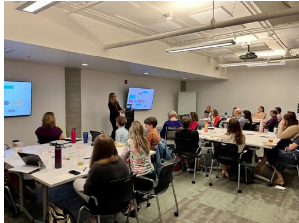
Early Childhood Evaluation Hub Learning Session