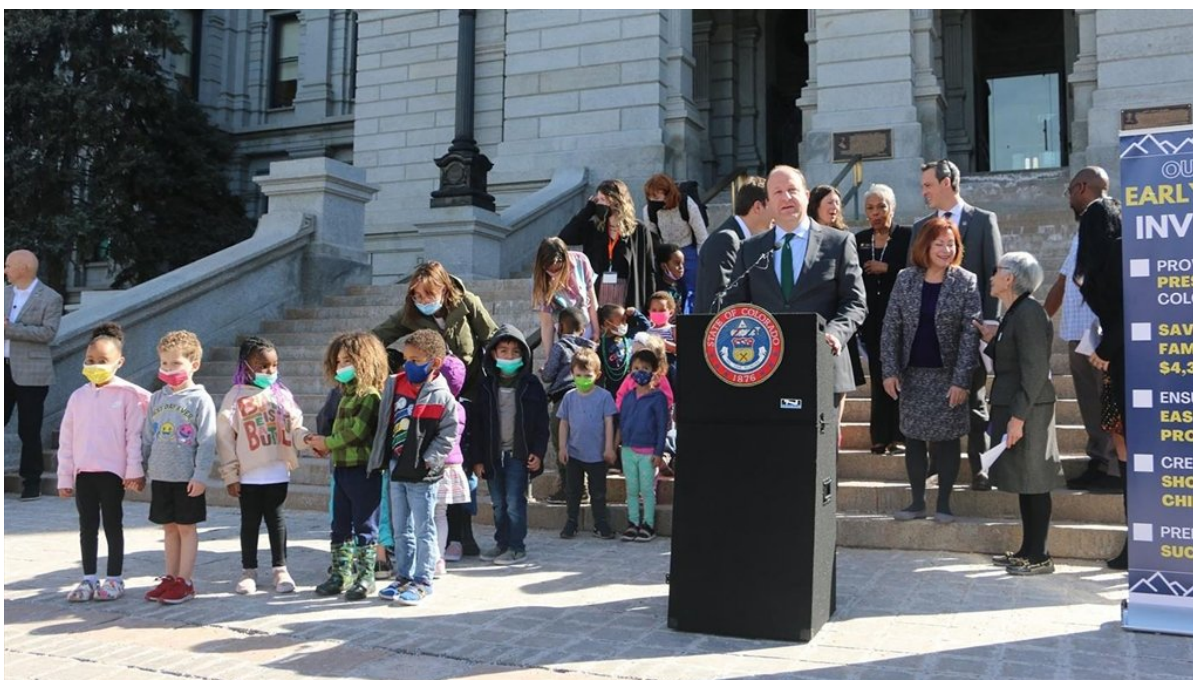
Governor Jared Polis, joined by preschoolers, speaks about plans for Colorado's Department of Early Childhood and the universal preschool program.

As Colorado's policy lab, we work together with a broad range of government and community partners throughout the full legislative cycle. Together, we unlock data-informed solutions to our most pressing social problems, working to understand root causes, identifying opportunities to foster meaningful change, and activating stakeholders to advocate for policy solutions. When these changes become law, we support partners in translating the policy into effective programs and practices, and strengthen their ability to continue collecting data to guide ongoing work. This month, we lift up—and celebrate—legislation that these efforts helped to inform in this year's legislative session, and feature projects underway to effectively implement policy wins from the 2021 legislative session.